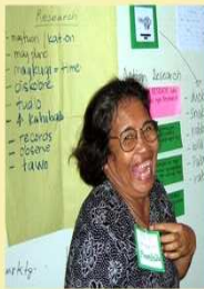
A community researcher