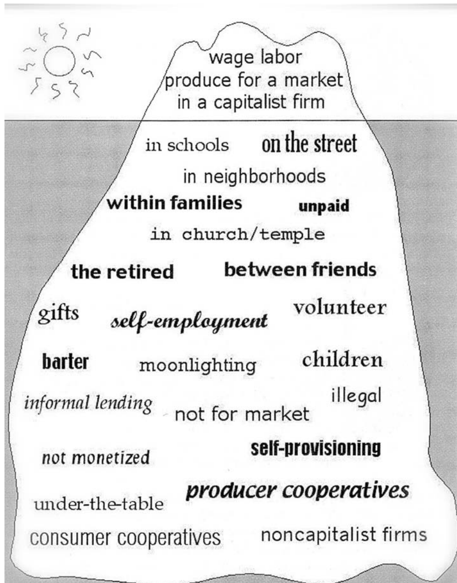
Figure 2.1: The diverse economy iceberg.

Drawn by Ken Byrne.