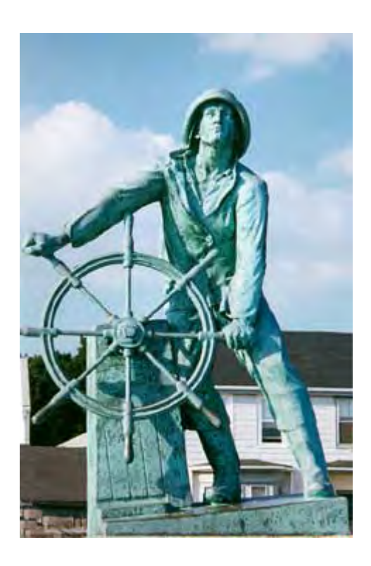
Figure 1 The famous fisherman of Gloucester, MA can be read as depicting the neoclassical subject and space of fishing. Individual, rugged and independent, this fisherman appears to work alone in his struggle against nature and in competition with other fisherman. The space into which he ventures is a location unspecified and his individuality is deeply entwined with his freedom to roam widely in search of fish.