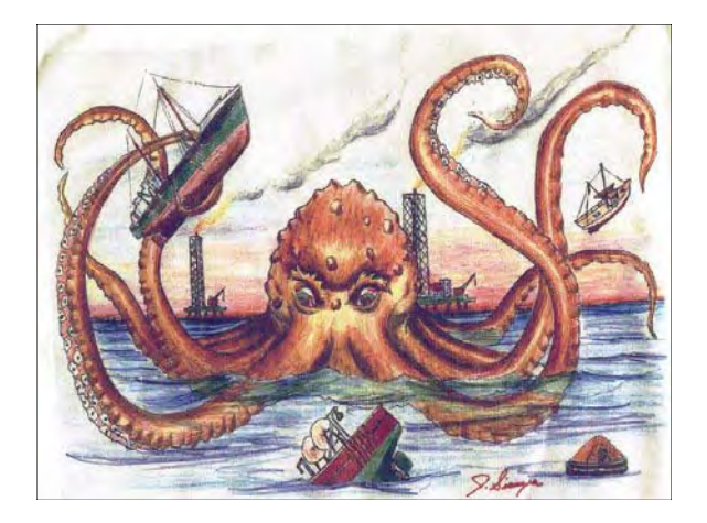
Figure 2: A fisher-produced T-shirt illustration (copyright Joseph Sinagra) captures this sentiment. Here the monster of big business and oil interests (capitalism?) has invaded traditional fishing locations and is destroying family-owned and operated fishing vessels.

Figure 1: The shaded areas show density of "fisherdays" for large trawl boats originating from Gloucester, Massachusetts aggregated for the period 1994-2000. Original data from the National Marine Fisheries Service (NMFS), Northeast Fisheries Science Center.