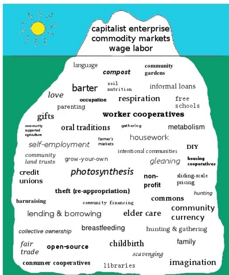
Figure 1: The diverse economies "iceberg" (Original by Ken Byrne, modified by Ethan Miller)

It is precisely the task of amplifying this instability that J.K. Gibson-Graham has taken on in her critique of “capitalocentric” models of economy and in the development of a notion of diverse economies. 12 The Diverse Economies framework, which is often introduced via the image of a floating iceberg (Figure 1), helps to identify and amplify the myriad practices and relations that continually “escape” the hegemonic narrative of the Economy. These practices are shown below the waterline, submerged under those activities that are seen as part of the ‘real’ economy—working for a wage or salary in a job connected to business and transacting commoditized goods and services via the capitalist market. 13